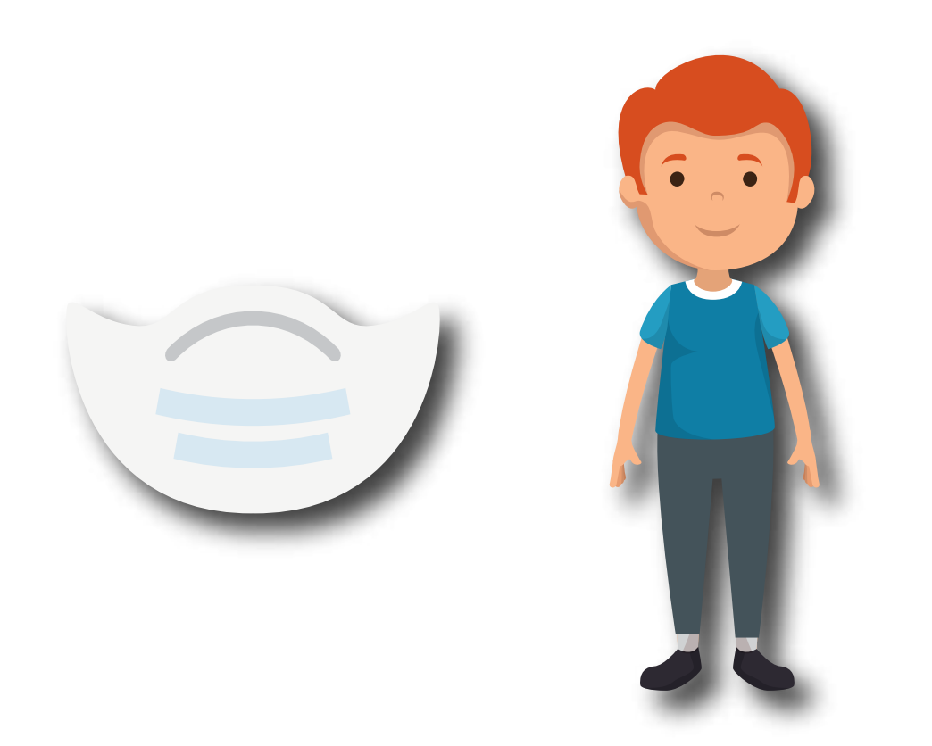
My mask helps keep me safe even if I feel healthy.