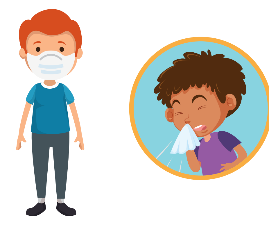
My mask helps keep me safe when others cough or sneeze.